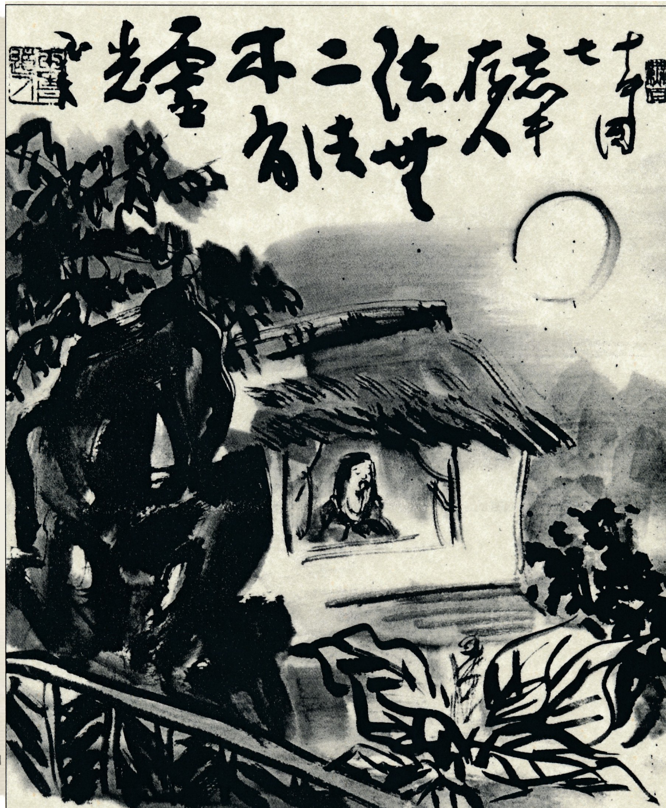
Hidden in Plain